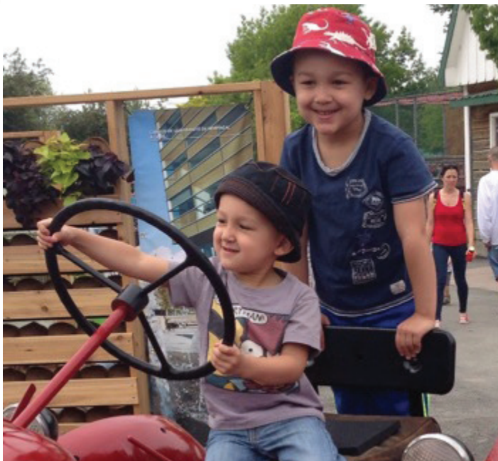
PO-4 Postal Clerk Laval, QC

"His gifts leave the world a better place."